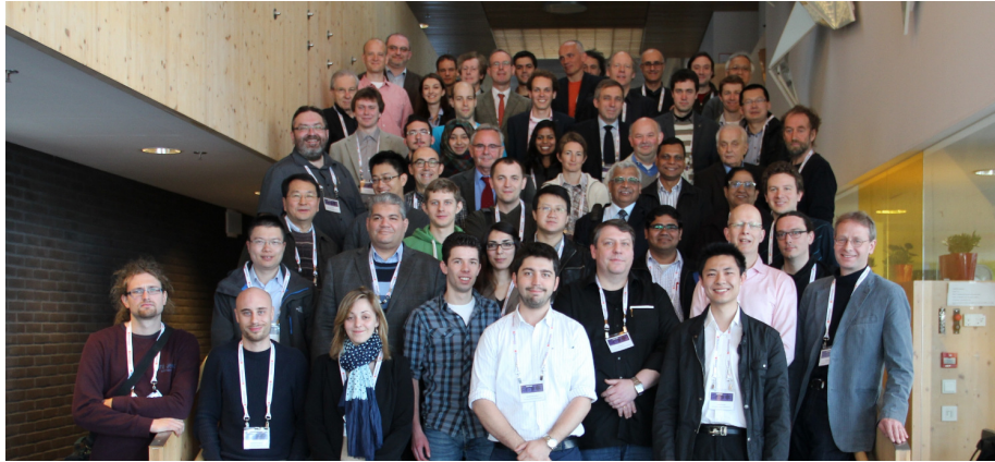
Participants of the XXI International Workshop on Optical Wave & Waveguide Theory and Numerical Modelling, Enschede, The Netherlands, April 19-20, 2013

The organizers were grateful for the interest and the financial support of the following companies and institutions: PhoeniX Software, The Netherlands, MESA + Institute for Nanotechnology, University of Twente, JCMwave GmbH, Germany, Optiwave Systems Inc., Canada, IEEE Photonics Society, Benelux Chapter, Lumerical Solutions Inc., Canada, Focal Machine Vision & Optical Systems, The Netherlands, and LioniX BV, The Netherlands. Their delegates were present at the workshop; the companies and institutions had posters on display in a separate section during the poster session.